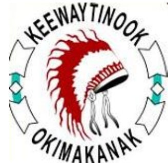
Keewaytinook Okimakanak http://knet.ca

This document outlines a community-based broadband infrastructure and operations policy for nation-to-nation discussions, negotiations and cooperation between First Nations and government stakeholders.