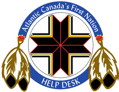
Atlantic Canada's First Nation Help Desk / Mi'kmaw Kina'matnewey http://firstnationhelp.com